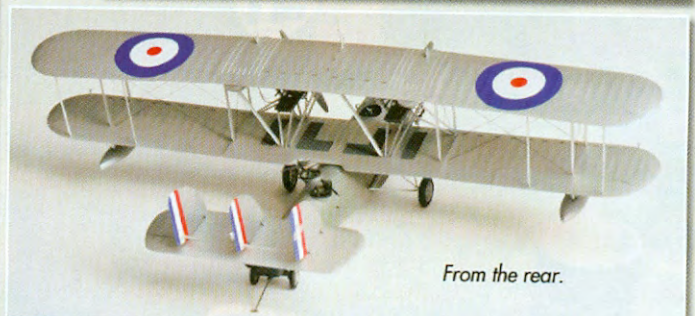
From the rear.