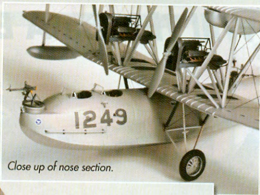
Close up of nose section.

Our good friend Wojciech Kulakowski from Silver Wings Models in Karkow, Poland sent us these images of Jacek Sznajder's superbly built 1:72 scale Silver Wings' Short Southampton Mk II.